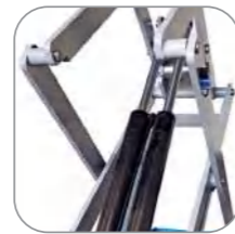
Dual double cylinders design 4 油缸同步系统