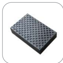
Rubber pads (4 pcs) 举升胶垫 4 个