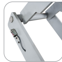
Electronic synchronization through photo sensor and reflector 电子装置防止车辆侧翻