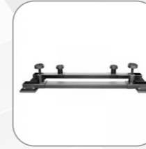
SUV adapter kit SUV 加高支架