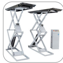
Automatic air bleeding by button 一键调平功能