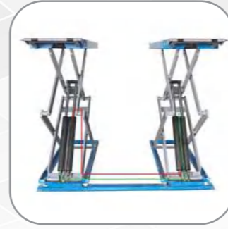
Double master / slave system, therefore no compressed air and no safety rack necessary! 双油路设计完美保障液压安全, 无需气源和安全锁!