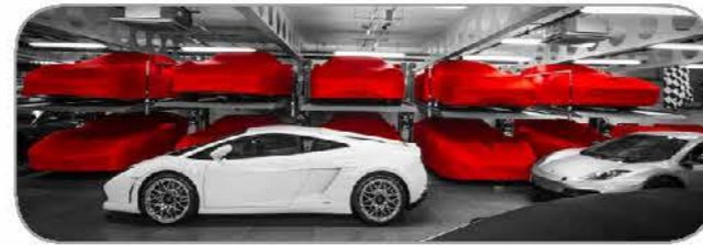
Parking space doubler 上下双层停车设计