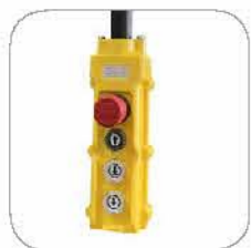
24v safety control 24v 安全电压操作