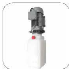
Aluminum motor 铝电机散热性能好