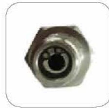
Safety valves against hose breaking 安全阀确保使用安全