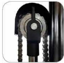
Chain protector design 链条防脱防夹手功能