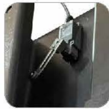
Height limit switch 上限位开关